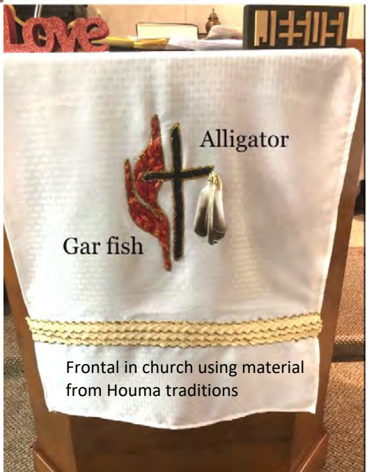
Frontal in church using material from Houma traditions