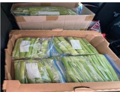
20 gallon bags of fennel stems