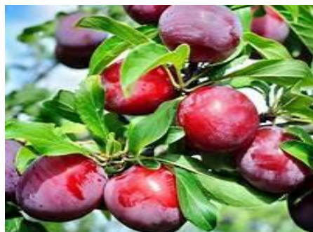
4 lbs of plums